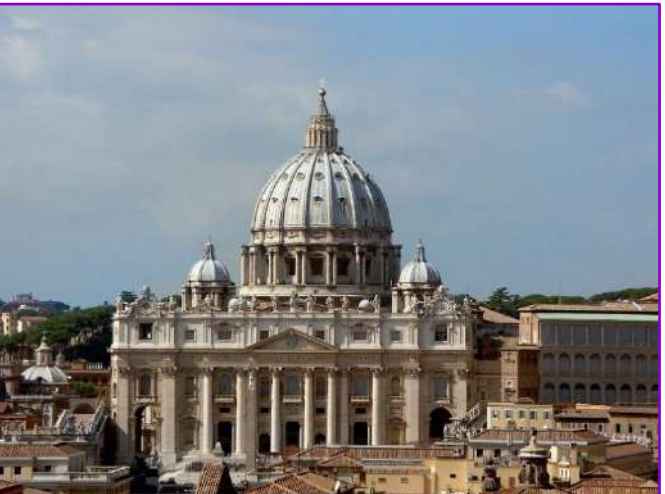
Day 12 - DEPARTURE FROM ROME

Depart for airport to fly back to hometown with unforgettable memories.